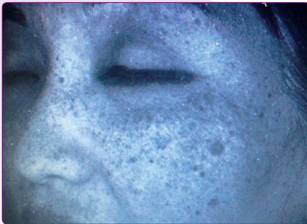
Visia sample showing UV damage.

We recommend that a baseline Visia Complexion Analysis® photograph be established before the start of a client's treatment plan. It is important to take the first and subsequent photographs at about the same time of day, with the same amount of makeup on (or not). The freshness of makeup and/or cleanliness of the skin and pores influence the accuracy of the analysis. It's important to keep these conditions controlled for post-treatment analysis.