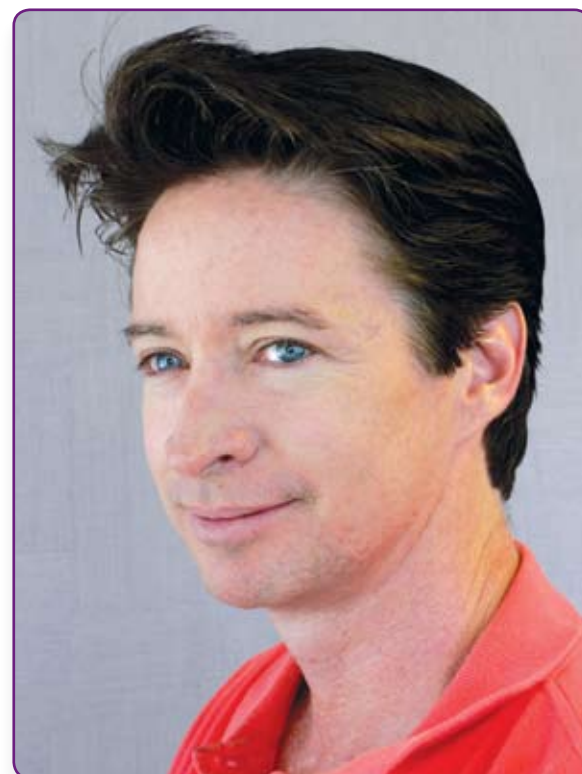
Fraxel client after treatment.

The Fraxel® 1500 SR Laser treatment delivers noticeable results for melasma clients. Imagine that each dark spot is breaking up into smaller spots with each treatment, until the spot gets smaller and tinier until most of the brown color has dissipated. For some clients, their melasma will disappear.