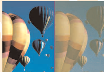
Decreased color intensity

The typical symptom of cataract formation is a slow, progressive, and painless decrease in vision. Other changes include: blurring of vision; glare, particularly at night; frequent eyeglass prescription change; a decrease in color intensity; a yellowing of images.